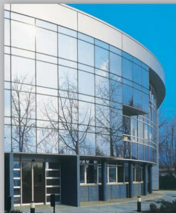
Architect : J.L. Paranche