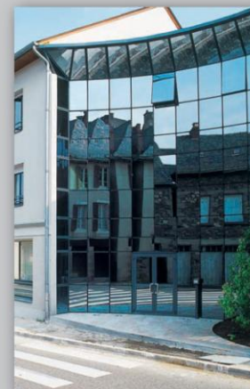
Architect : J.P. Tournier