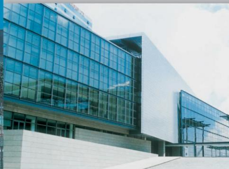
Architect : B. Soares